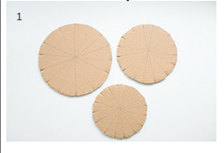
Step 1 : Draw 9 evenly spaced lines along the cardboard circle. Add a cut notch on each of the lines that you drew.