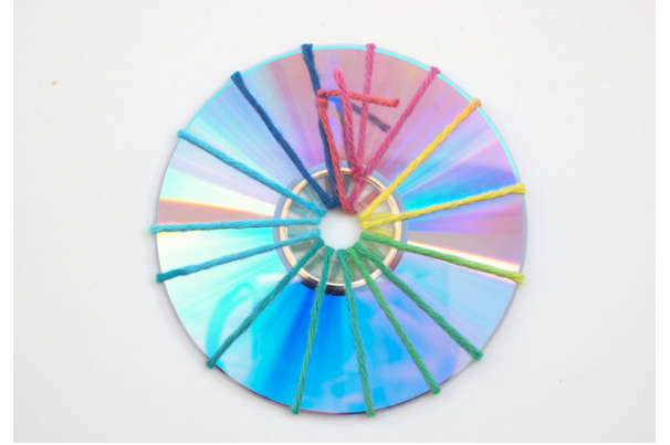
Step 1. Cut piece of yarn. Then tie it to your cd. Wrap your yarn an odd number of times around you cd. Make sure to pull the warp strings tight. Then, tie your string in place