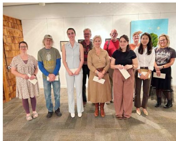
"Visual Evidence" Winners