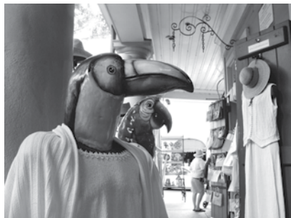
above: Stacey Mills Birds People Watching Digital Print 2009

Stacey Mills Photography Exhibition Reception Live music by Poor Farm Road Bluegrass Band Bowl Making Party for Empty Bowls Project Silent Auction Membership Drive Refreshments Open Studios in: Ceramics, Photography, Weaving, MAG Jr's