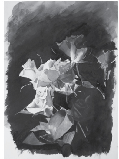
Above: St. Paul's Roses , mixed media

"As a child, my love of pencils and paper led me to create many drawings well into my adulthood."